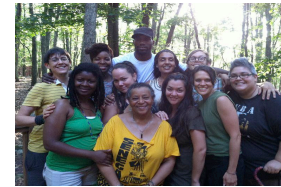
Third Root Community Health Center collective (Brooklyn)